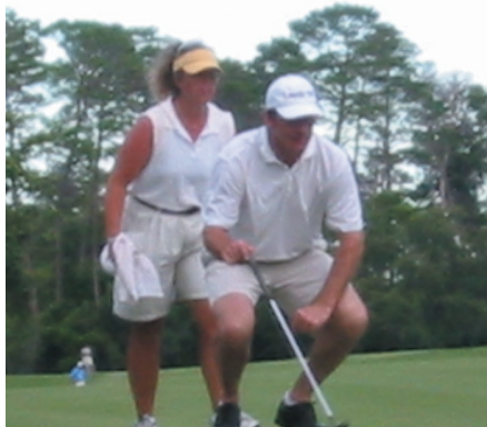
Nick Faldo and his caddie line up a putt at Lake Nona GC .